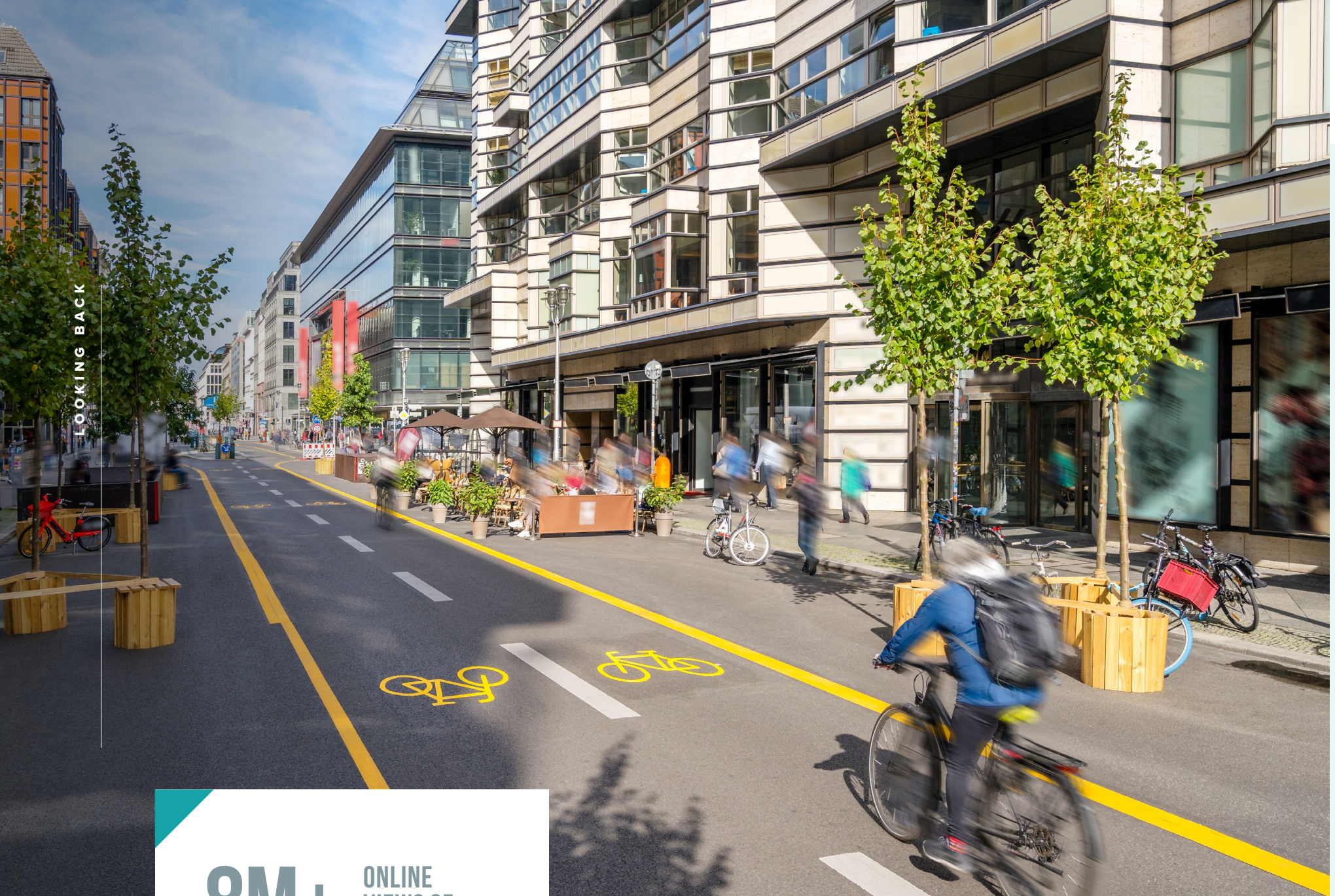
BICYCLE LANES IN BERLIN, GERMANY.